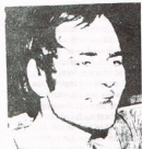
ANDREAS BAADER Shot