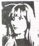
GUDRUN ENSSLIN Hanged